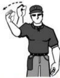
E. Strike or Out