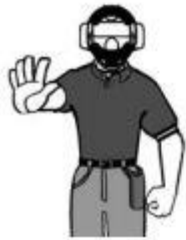
A. Do Not Pitch