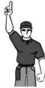
F. Infield Fly