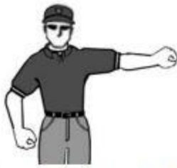
D. Delayed Dead Ball