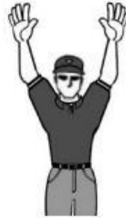
C. Time-Out, Foul Ball or Dead Ball