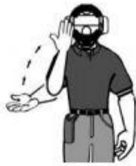
B. Play Ball